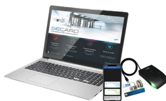
SECARD SECard configuration kit and OSDP™ v1 & v2 protocols