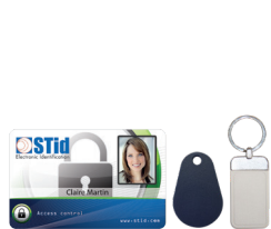
ISO cards & key holders (125 kHz, 13.56 MHz...)