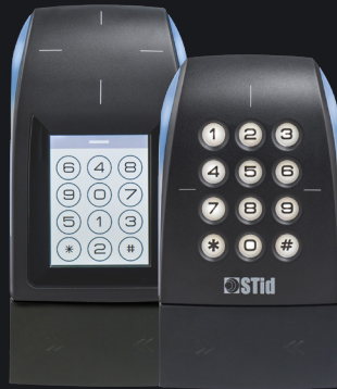
Available in touchscreen and keypad versions