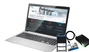
SECARD SECard configuration kit and SSCP® v1 & v2 and OSDP™ protocols

*Our readers only read the iCLASS™ chip serial number / UID PICO1444-3B. They do not read iCLASS™ cryptographic protection or the HID Global serial number / UID PICO 15693.