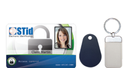
13.56 MHz or dual frequency ISO cards & key holders