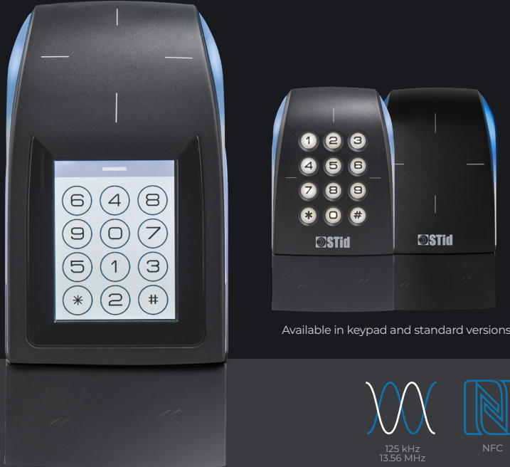
Available in keypad and standard versions

125 kHz, MIFARE® DESFIRE® EV2 & EV3, NFC