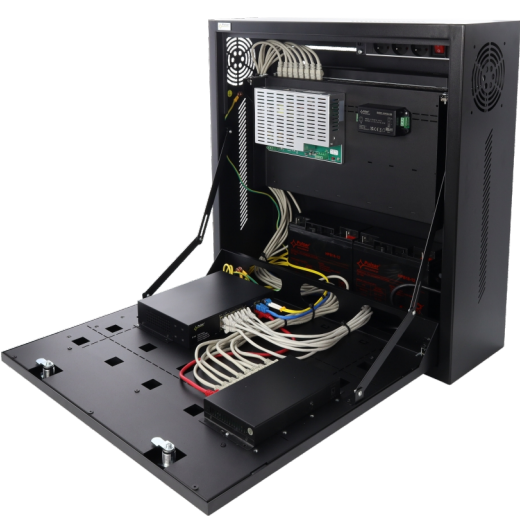
Sample assembly – monitor / recorder / PoE switches / PSU with battery backup for switches and recorder