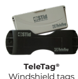
TeleTag® Windshield tags