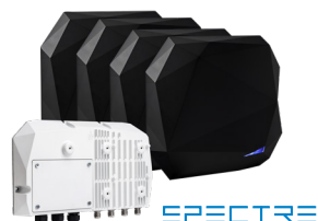
SLA - Scalable long-distance reader - 1 to 4 antennas