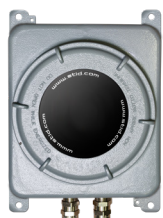
ATX - UHF reader certified ATEX & IECEx