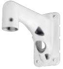
WV-QWL501S-W Wall Mount Bracket

Select a compatible accessory Accessory Selector (i-pro.com) .