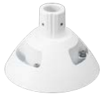
WV-QSR504S-W Mount Bracket