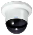
WV-QCD100G-W Dome Cover