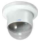
WV-QCD100C-W Dome Cover